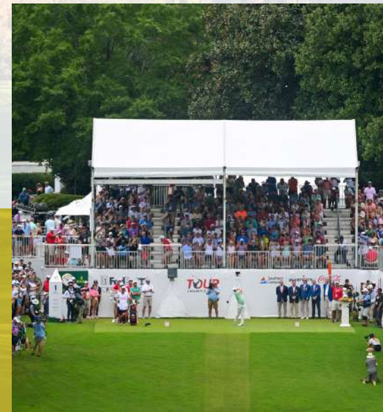
ADVERTISING & SPONSORSHIP FOR PERFORMANCE(S)