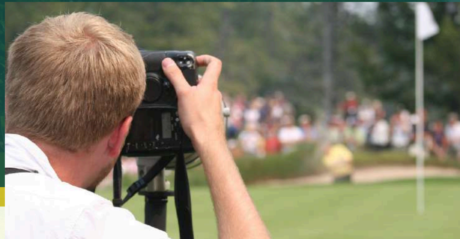
PERFORMANCE & STREAMING

Apart from our primary sponsorship packages, the Super Celebrity Shootout 2025 offers additional exclusive sponsorship opportunities. These packages are crafted to provide high-visibility brand exposure and create memorable experiences for attendees, ensuring your brand stands out and connects meaningfully with our audience. Choose from these unique sponsorships to elevate your brand presence.