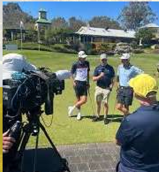
BROADCAST OR STREAMING DEALS