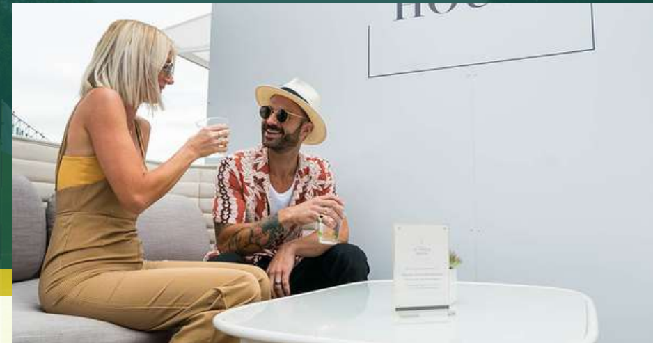
POP-UP LOUNGE EXPERIENCE