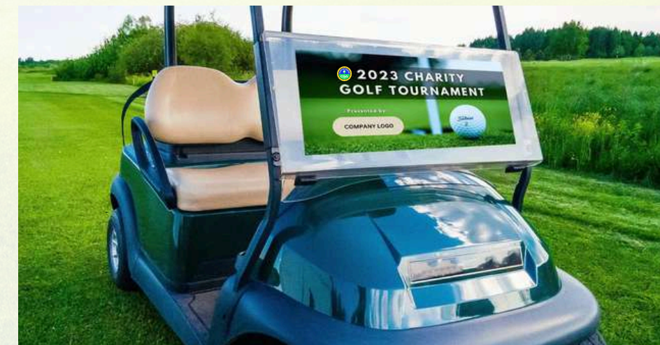
GOLF CART SPONSOR