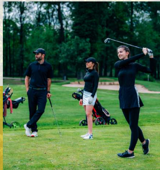
CELEBRITY SHOOTOUT SPONSORSHIP

The Super Celebrity Shootout 2025 offers a variety of additional promotional activities to help brands engage with a high-profile audience and create memorable experiences. These exclusive sponsorships and advertising opportunities enhance brand visibility and ensure your brand is seamlessly integrated into the event's exciting highlights.