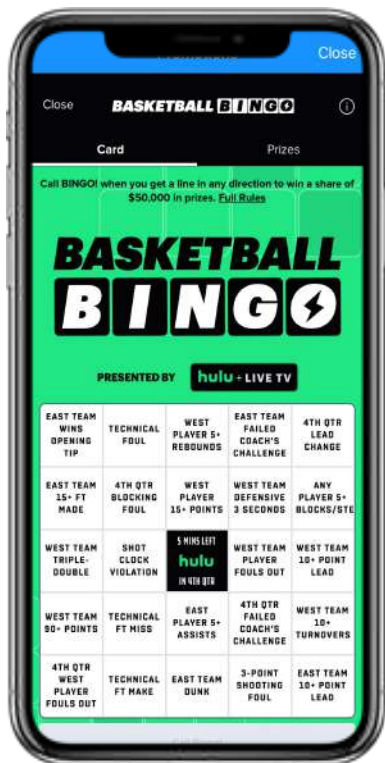
*Example of a custom branded Bingo board.