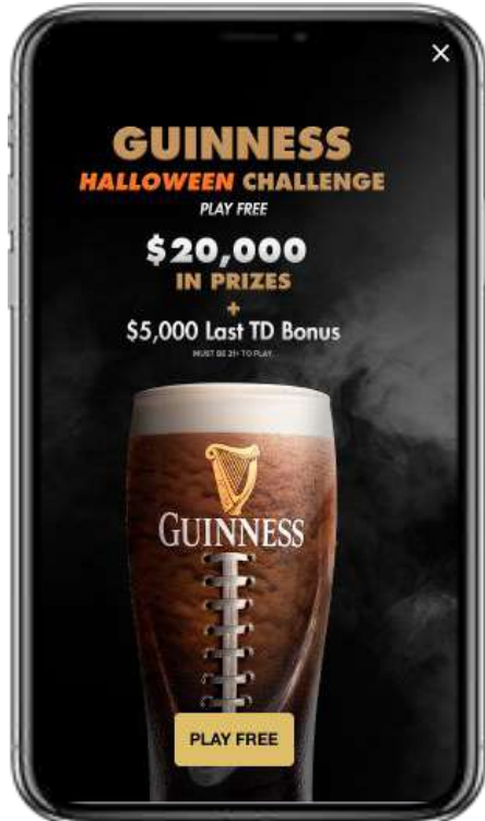
*Example of a custom branded NFL DFS Contest