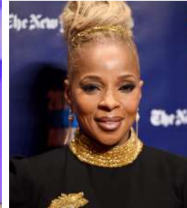
Mary J. Blige