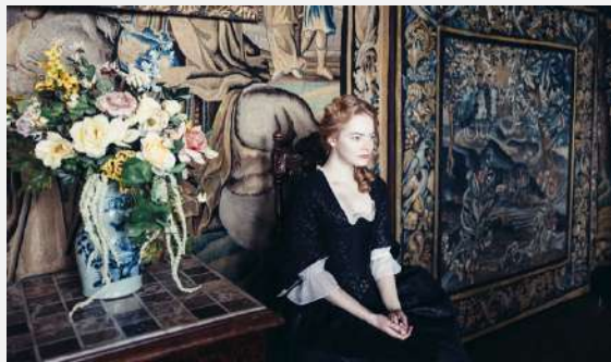
THE FAVOURITE Gotham Awards 2018