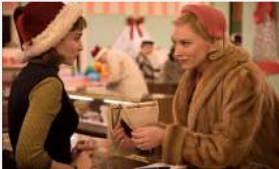
CAROL Gotham Awards 2015