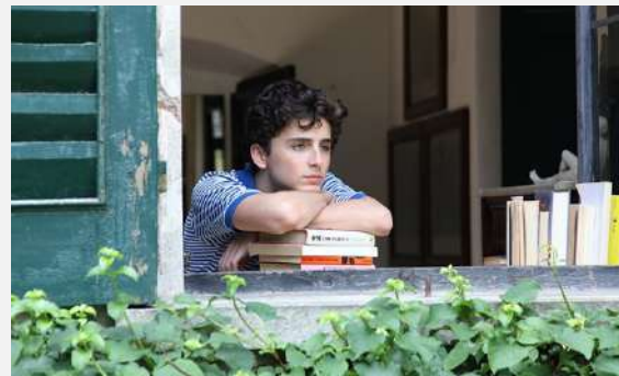
CALL ME BY YOUR NAME Gotham Awards 2017