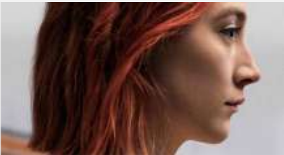
LADY BIRD Gotham Awards 2017

High-profile presenters, celebrity attendees and superior location provide an incomparable context for a branded presence.