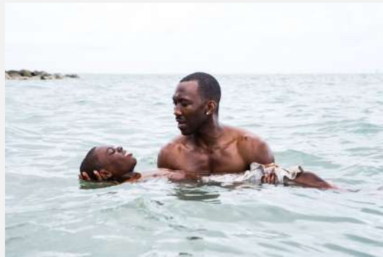
MOONLIGHT Gotham Awards 2016