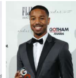
Michael B. Jordan