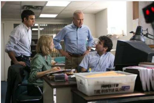
SPOTLIGHT Gotham Awards 2015